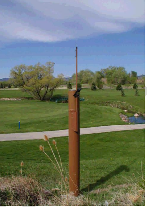
Packaged Pressure Transducer Station, City of Loveland, CO